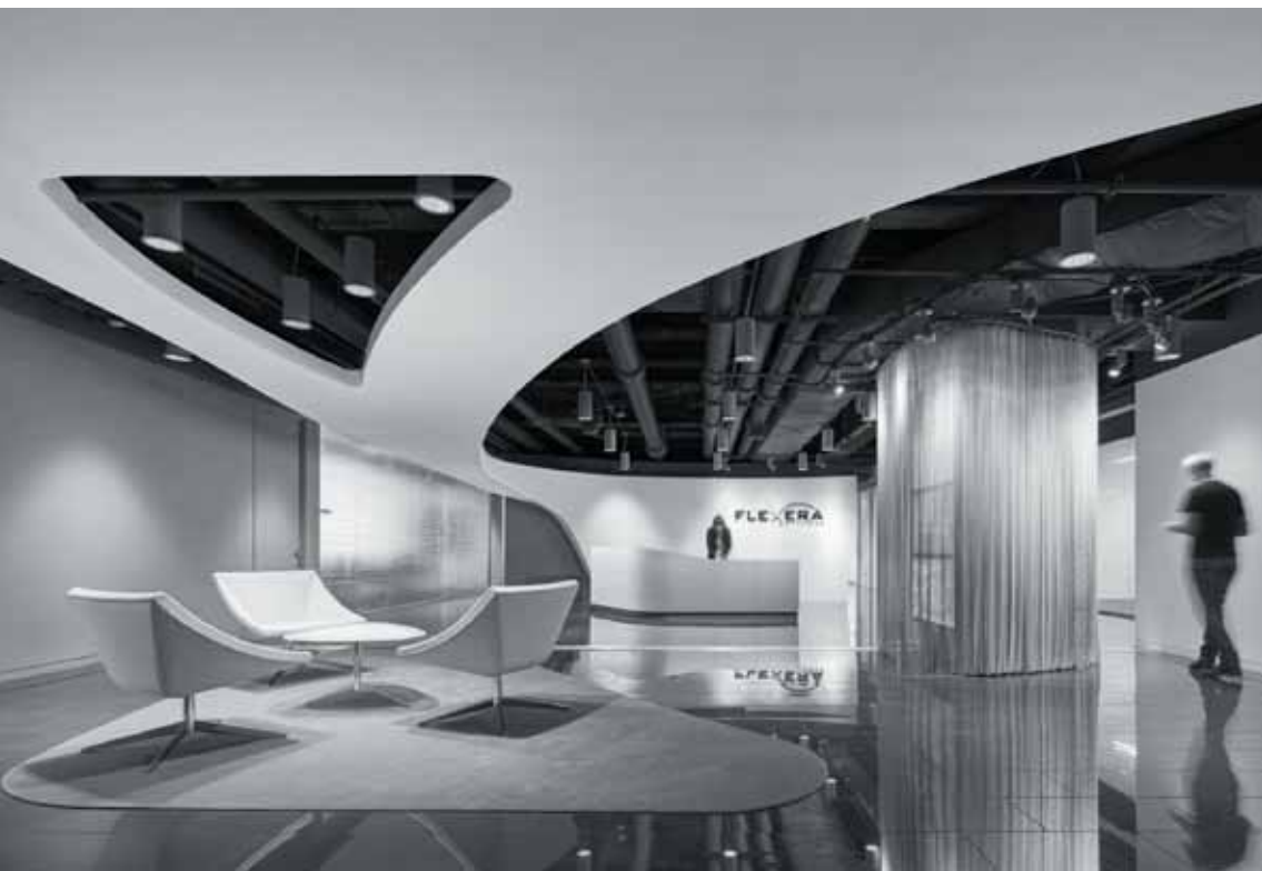
The headquarters of Flexera Software in Itasca, Illinois, is by CannonDesign (#15).

"Optimism remains high across the board"